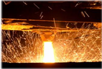
Steel & Aluminium