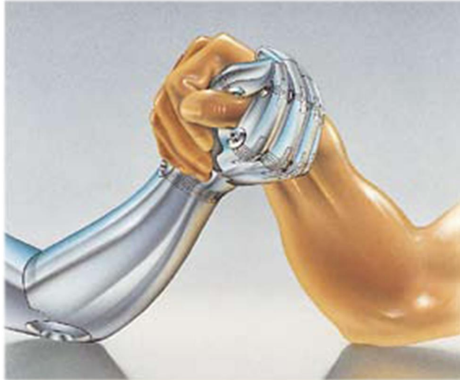
Slitan® - stronger than steel